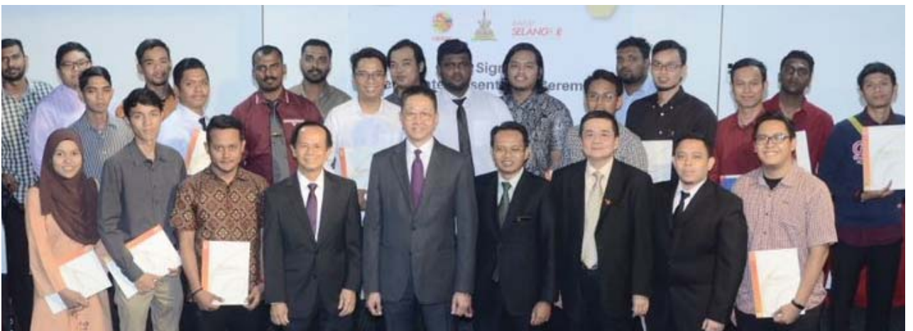
FWLS, FWS and SMART Programme