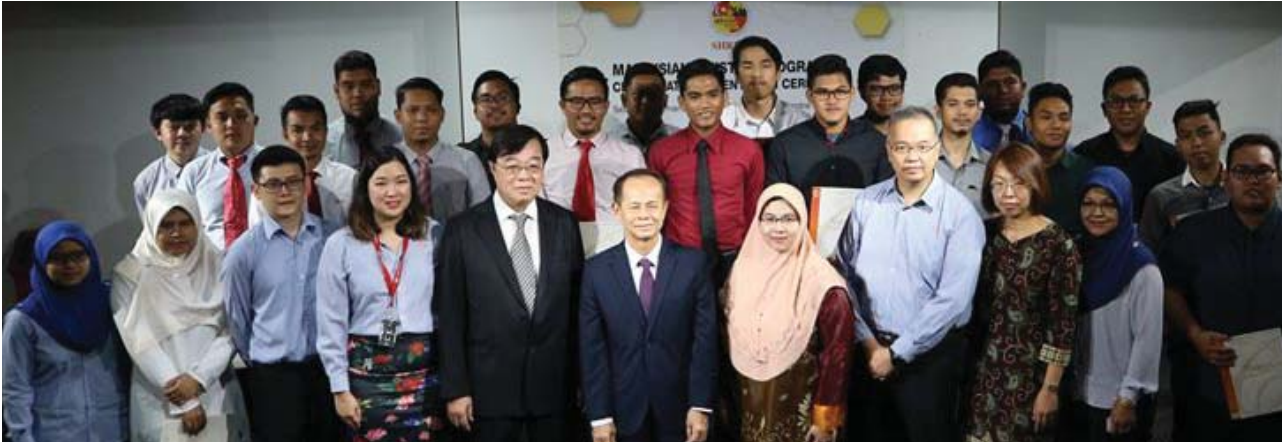
Malaysian MEISTER Programme