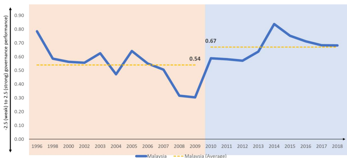
Figure 1: Malaysia’s regulatory quality performance (1996 – 2018).